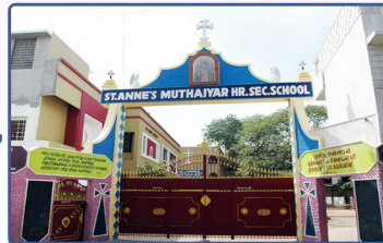
Muthaiyar Higher Secondary School, Panruti.