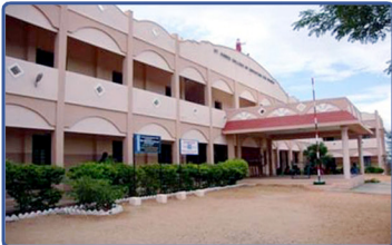
St. Anne's B.Ed College for women, Periyakulam.