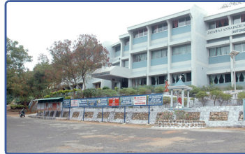
Jeyaraj Annapackiam College for women (Arts & Science), Periyakulam.

St. Anne's Community College St. Anne's I.T.I. Typewriting & Tailoring Institutes Computer Institutes Social Welfare Centres Hospital Health Centres Creches