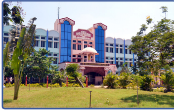
Annai Velankanni Polytechnic College, Panruti.