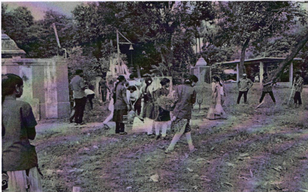
(21st December 2018 at Velai Nagar)