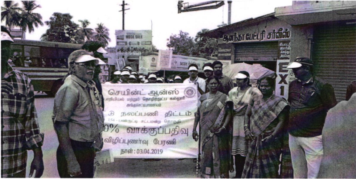
Our NSS Volunteers 100% Voting Awareness on 3 rd April 2019