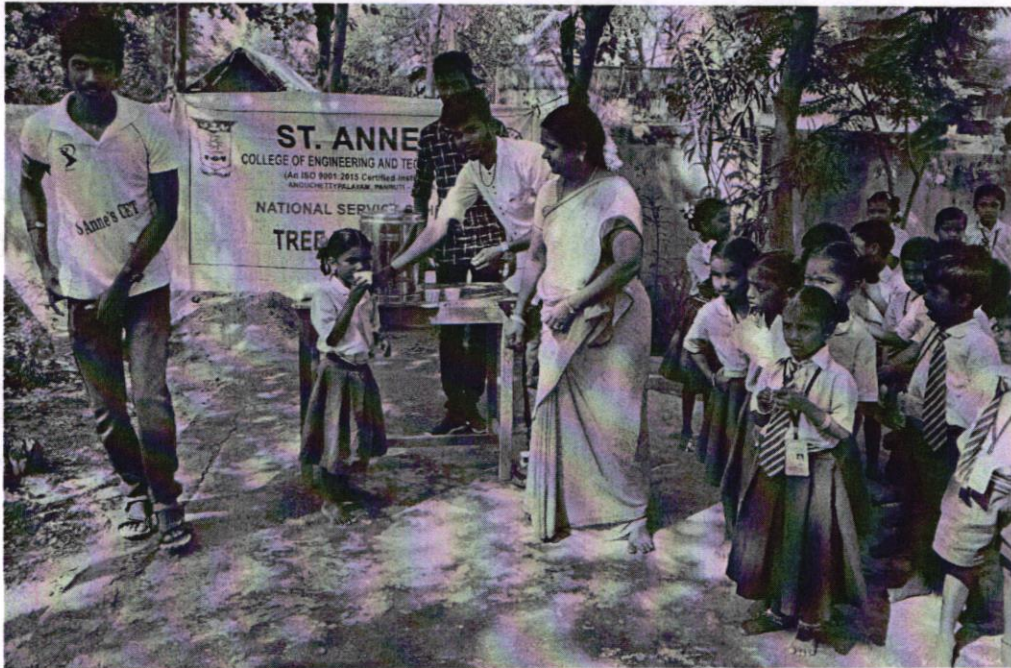
(Our NSS Volunteers providing Nilavembu Kashayam to the Govt. Primary school, Kokkupalayam village)