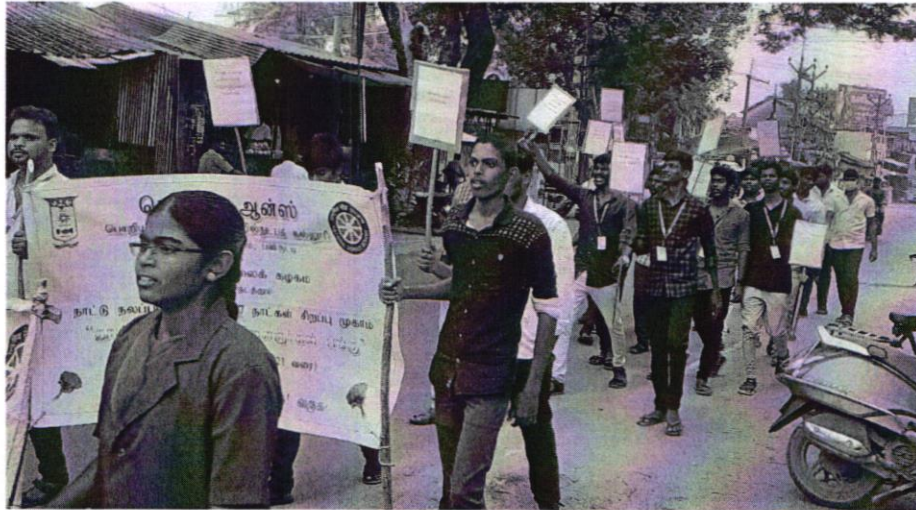
(Students rally on 'Plastic Eradication Awareness')

To make the drive more effective and to spread the message "No more Plastic Bags" to the maximum people, a rally was organized under the "Plastic Free Cleanliness Drive". This drive will create awareness among the people about the harmful effects of the single use plastic as a result they will be motivated towards the use of paper or fabric (Cotton or Jute) bags.