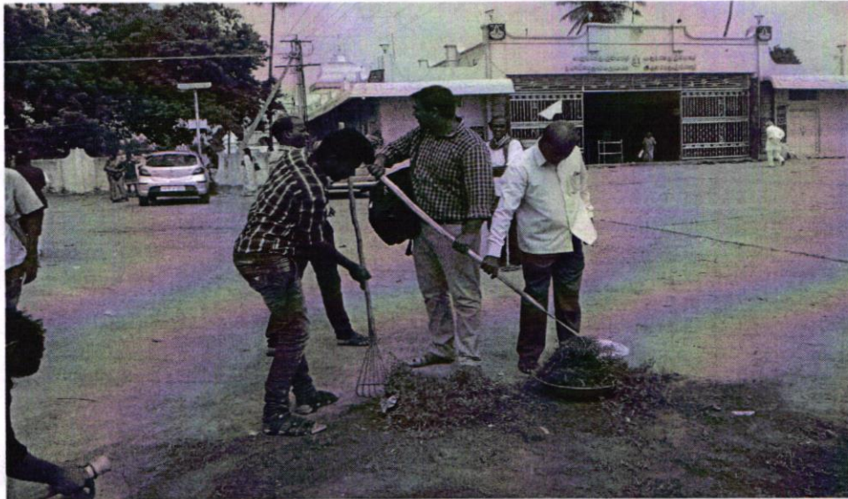
Our NSS Volunteers Cleaning the SATHIYA GANA SABAI Campus on 20 th December 2018 at Vadaloor.