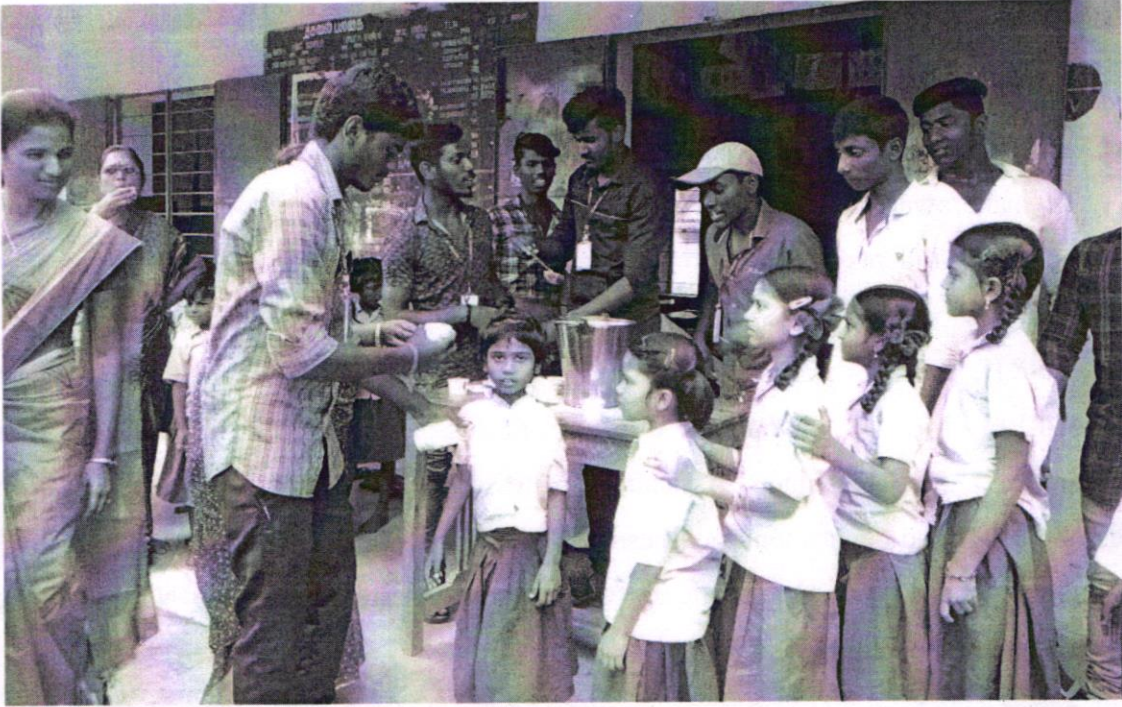
(Our NSS Volunteers providing Nilavembu Kashayam to the Govt. Primary school, Kokkupalayam village)