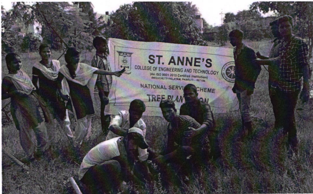
(NSS Volunteers Planting Tree on 21 st November 2018 at St. Mary Church, Panruti)

The students also placed bricks around each plant and each student took the responsibility to nourish and maintain the allotted plant. Eventually, the ground attained a glorious look. As the whole world is facing the problem of global warming and to recover from such problem planting the trees has become one of the most important aspects. All the Volunteers were filled with joy after the tree plantation event was finished, because they contributed positively to nurture the nature.