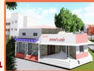
11. ANNE'S CAFE