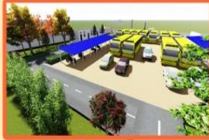
4. PARKING AREA