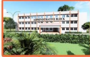
5. ADMINISTRATIVE BLOCK