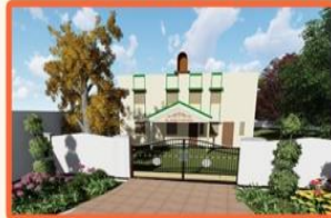
7. ST. ANNE'S CONVENT