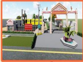
1. FRONT ARCH