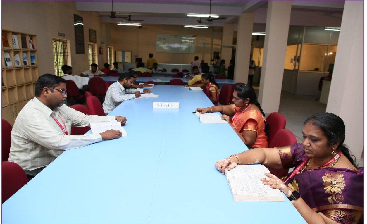
ONLINE REFERENCE SECTION