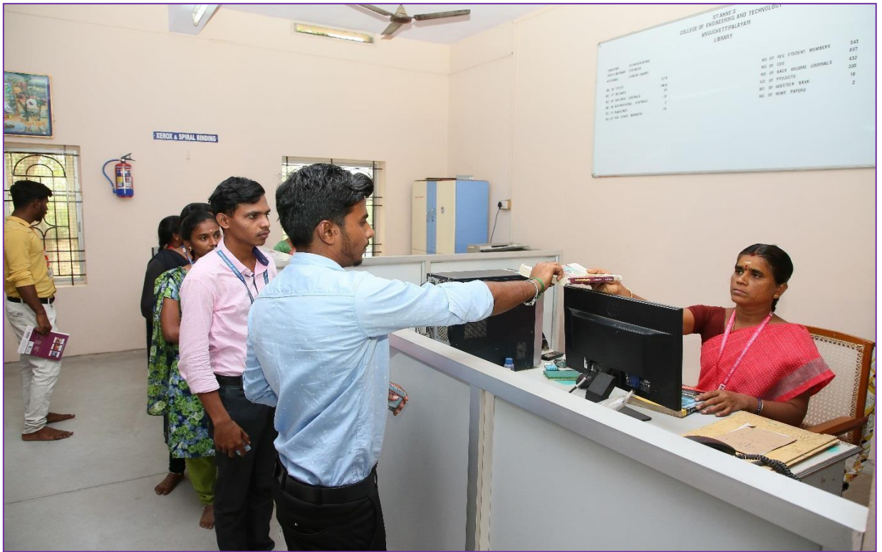
PHOTO COPIER SECTION