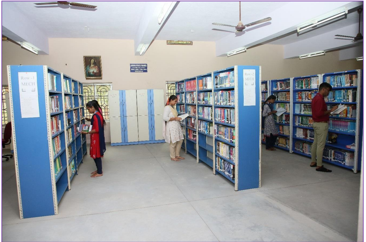
STUDENT READING SECTION