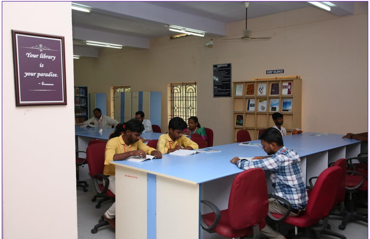
STAFF READING SECTION