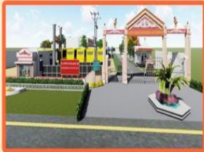
1. FRONT ARCH