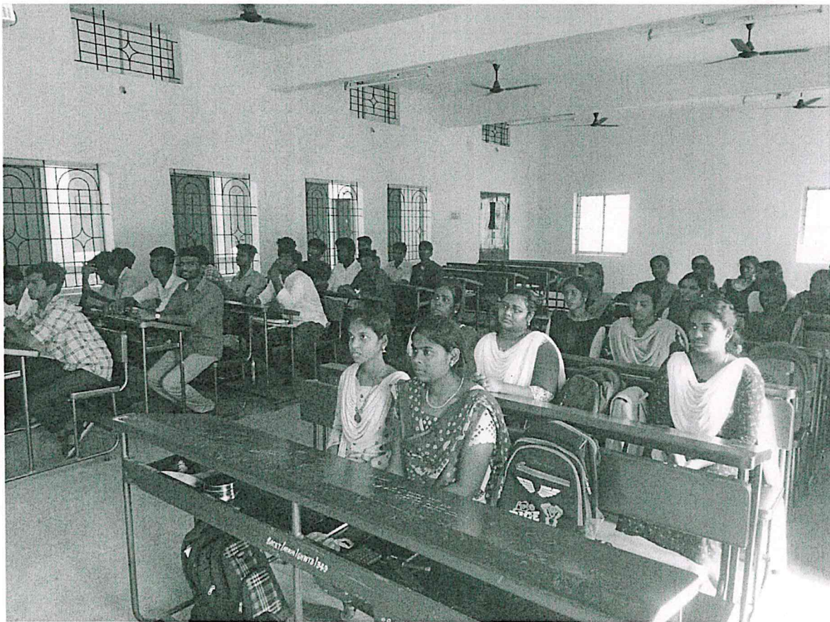
Students Listen to the Lecture on the basics of Communication during Communication Skill training program on 20.10.2021

In order to develop and enhance the students' soft skills, Career development and their communication skills, Training and Development of St. Anne's College of Engineering and Technology has organized a ten days training program for the students of Department of Computer Science Engineering and Department of Mechanical Engineering from 18 th October, 2021 to 27 th October, 2021.