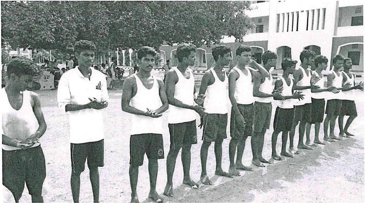
1. Kho-Kho (Boys) - Third place

Our Physical Director attended the Anna University Zonal(V) Sports Committee meeting for the academic year 2018-2019, held in Mailam Engineering College. They planned to conduct different events in various colleges. Our college students were participated in all the events and they got prizes for four events.