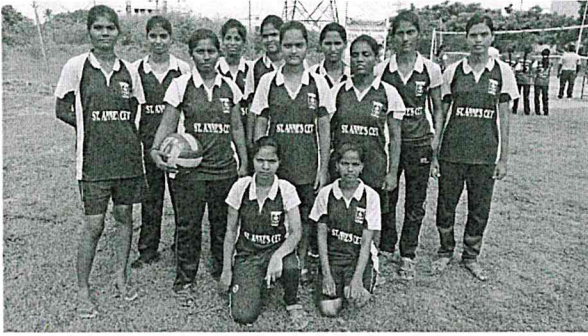
2. Volley Ball (Girls) -Third place