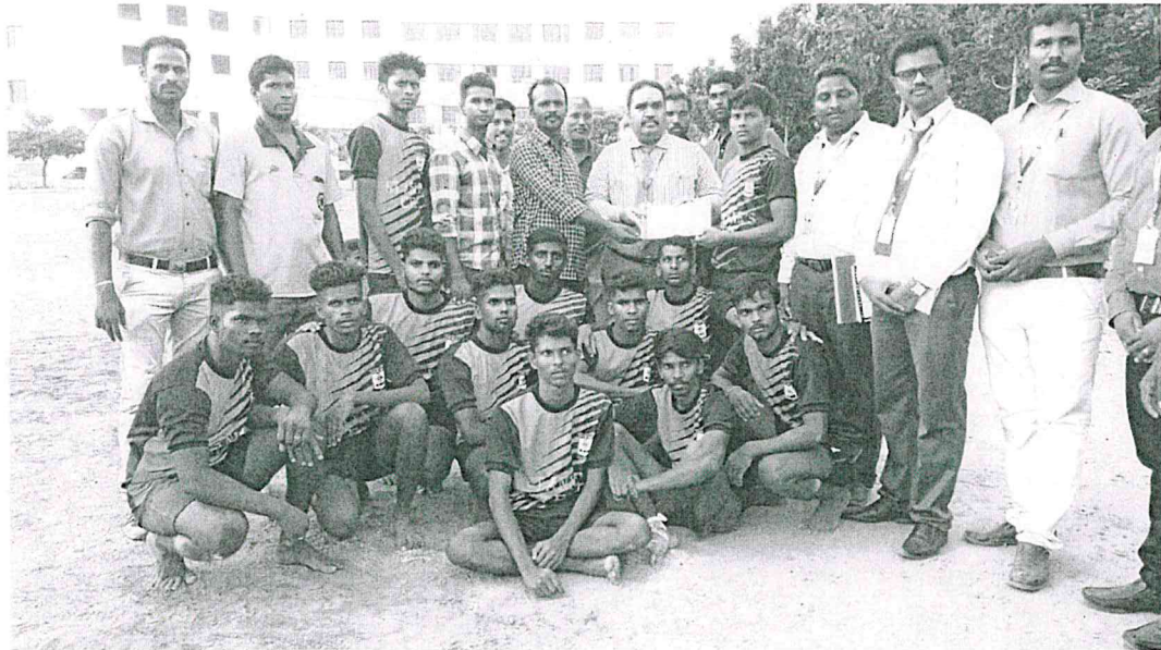
4. Kabbadi (Boys) - Second Place

The prize winners were appreciated by our College Secretary and Principal.