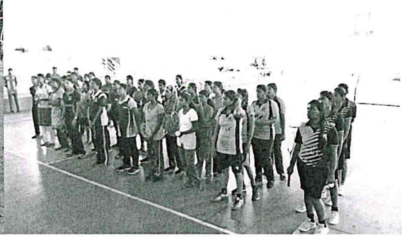
3. Bad-Minton (Girls)- Third place