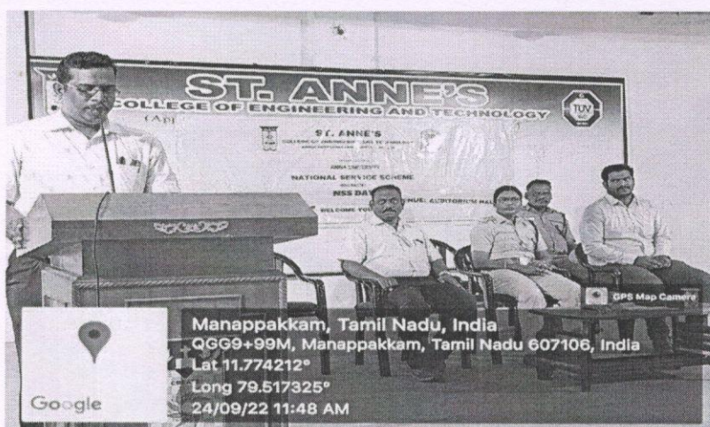
NSS Day Celebration

They taught different methodologies such as Cooling method, Smothering method, Starvation method and so on. Fire safety training educated students, a set of practices & procedures to minimize the destruction caused by fire hazards at work/public place.