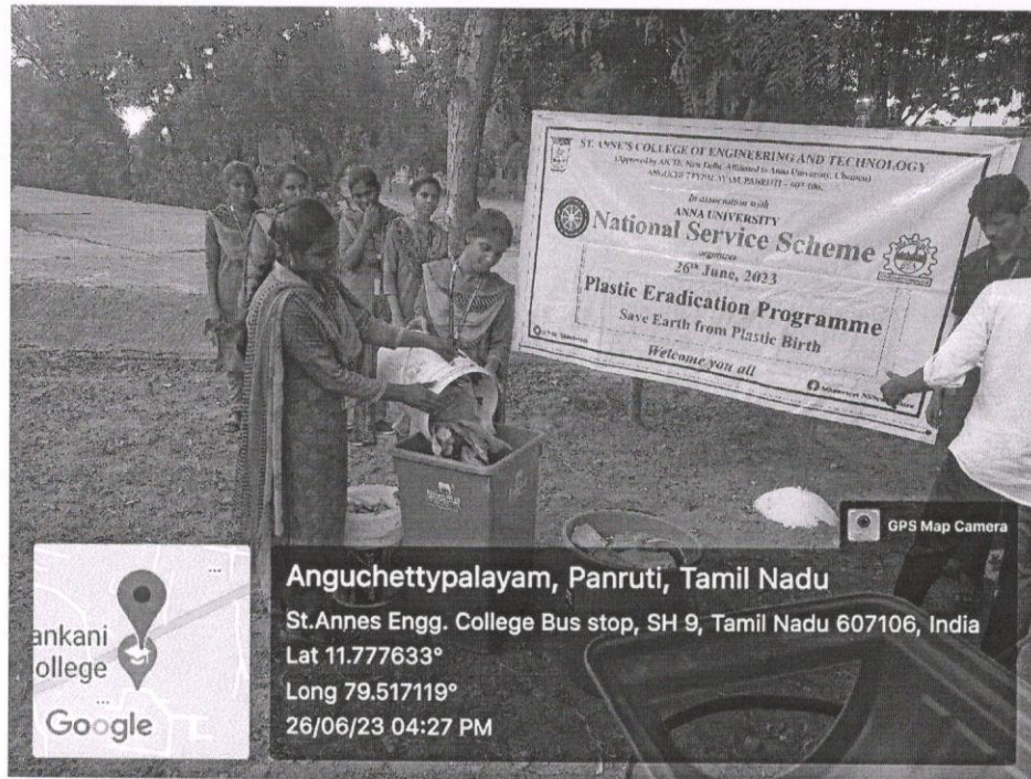
Plastic Eradication Programme