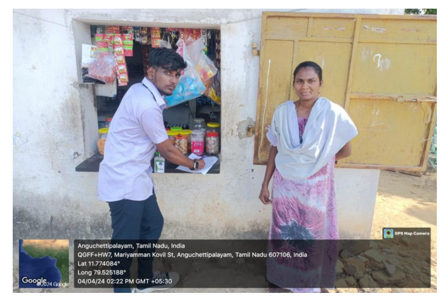
SENSES REGARDING EDUCATION AND SELF-BUSINESS

In the Afternoon session our NSS volunteers were taken the Survey around the village people regarding how many people are educated and how many people's are doing self business.