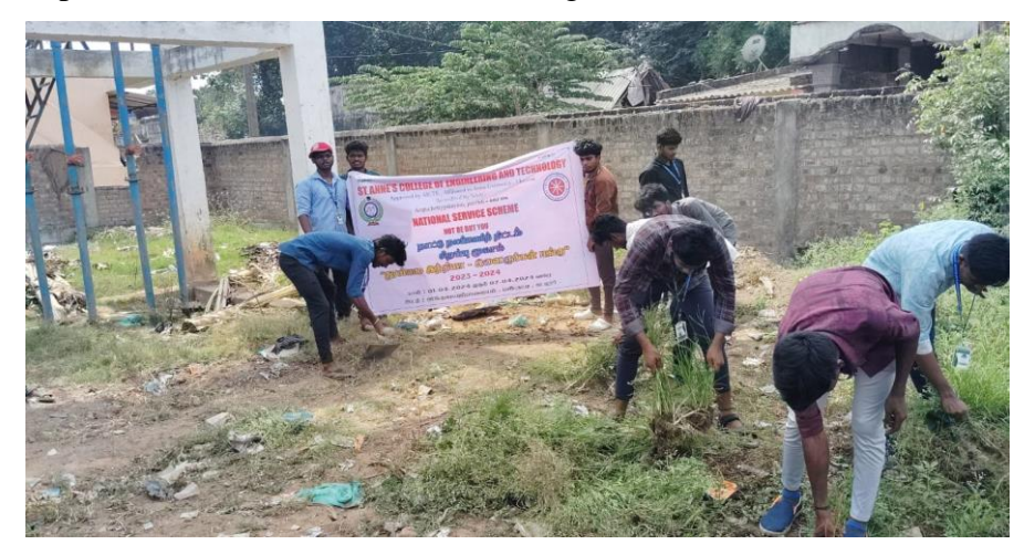
SCHOOL CAMPUS CLEANING DRIVE

In the Afternoon session, our NSS Volunteers cleaned the village roads, removed dust heaps, cleared the stagnant drainages and attempted to create awareness on cleanliness and hygiene. They swept and cleaned the roads of the village.